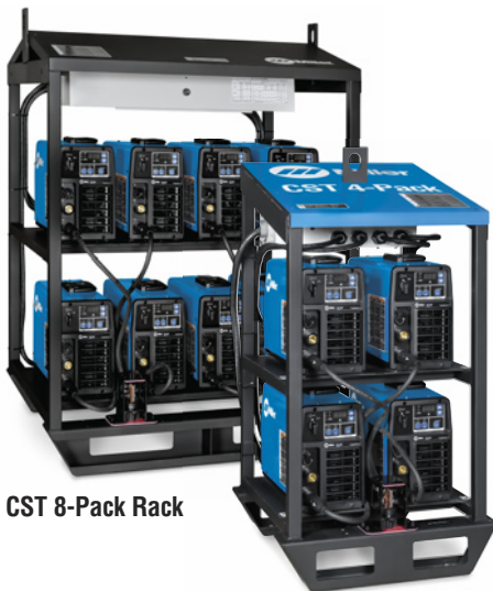
CST 8-Pack Rack